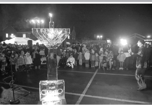
Fire and Ice at the Chabad of Pittsford Community Menorah Lighting & Chanukah celebration!