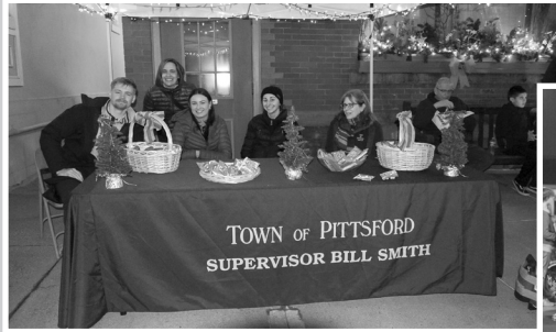
A fun time at the Chamber of Commerce's Candlelight Night!

There was plenty of celebrating in December. Town staff were on hand to greet attendees at the annual Chamber of Commerce Candlelight Night festivities, which included lighting the town Christmas tree, carolers, horse-drawn wagon rides, treats, music, and more. Our friends at Chabad of Pittsford welcomed the community at this year's town Menorah Lighting and Chanukah Celebration on December 19 – an annual community event complete with music, food and a dazzling fire-and-ice menorah lighting!