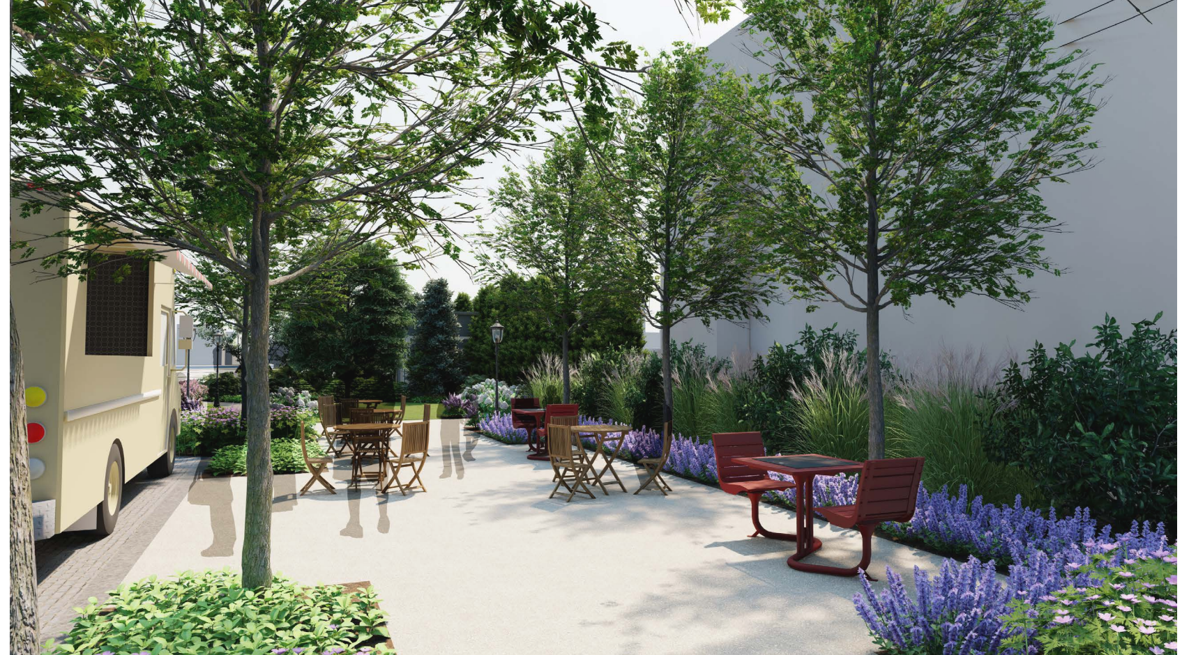
Option with Pergola Removed Image illustrating the Revised Schematic Design with the pergola excluded in anticipation of budget constraints.