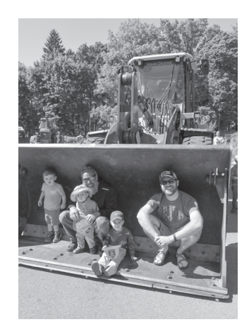
A great time getting to Meet the Machines.

Family Halloween Fest Sunday, October 23, 2:00 - 5:00pm Spiegel Pittsford Community Center