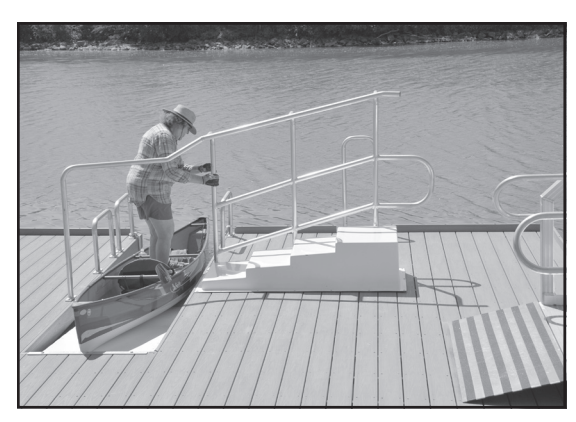
Our new handicapped-accessible kayak launch is ready for use! You'll find it on the Canal path by the parking lot for the Town's Sewer Department Office at 3899 Monroe Avenue. The launch makes it easier than ever to get on the water and enjoy the beauty of our canal, especially for those whose mobility is limited.

A notable addition in Town is our new handicapped-accessible kayak launch . You'll find it on the canal path, by the parking lot for the Town's Sewer Department Office at 3899 Monroe Avenue. For those whose mobility is limited, the launch makes it easier than ever to get on the water to enjoy the beauty of our canal. It makes it easier for everyone. The gangway and docking area are sloped