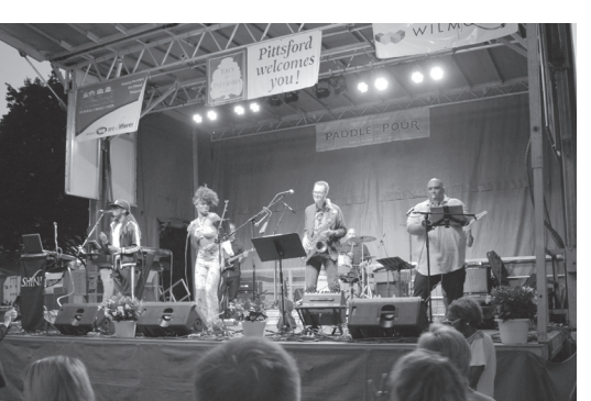
Getting funky at Paddle and Pour with Shine.