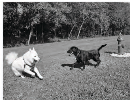
The new Pittsford Town Dog Park has plenty of room to run and convenient amenities.

Pittsford's first Dog Park opened on October 8. Located on Town land at 34 East Street, the park features play structures and water fountains for dogs and benches and picnic tables for their owners. It includes an area for small dogs and a dog washing station. The park conveniently connects to two Town trails for access by foot or by bike. Residents who register to use the park have access to all dog parks in the Monroe County Dog Park system. For registration information visit the Parks page on the Town website.