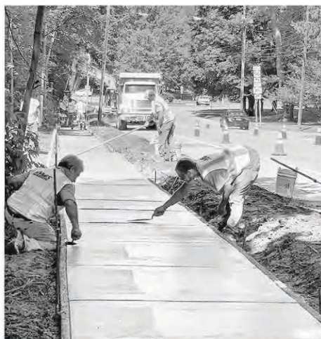
Crews finishing the latest stretch of the East Avenue Sidewalk Project.

During this phase of sidewalk construction State Department of Transportation crews have been repaving and restriping East Avenue. Town crews continue to coordinate with the DOT to minimize disruption and inconvenience for residents and motorists along that section of East Avenue.