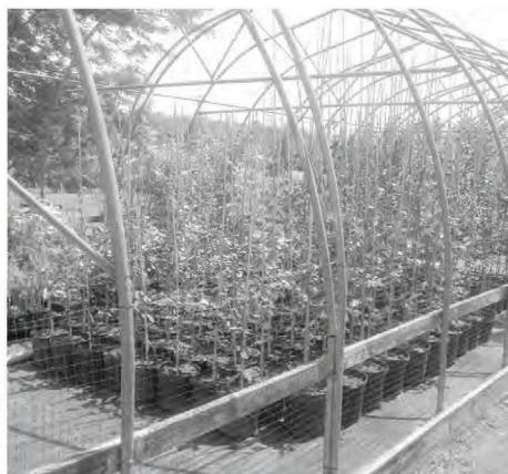
At nearly four years old, saplings from the Town's iconic copper beech tree are thriving.

When the iconic copper beech tree in the Town Park near the four corners in the heart of the Village succumbed to disease and was removed in 2018, the Town took steps to preserve its legacy. Over 100 healthy cuttings from the tree were grafted onto rootstock, enabling them to grow over the past nearly four years into healthy saplings. The young trees – actual clones of the grand old copper beech – are maintained at Coldwater Pond Nursery and will remain there for another 2 to 3 years until they're ready for planting. The nursery provides this update: the saplings "have fantastic color and are the epitome of good health." Once the trees are established enough to be planted, they'll be ready to populate our parks and open spaces.