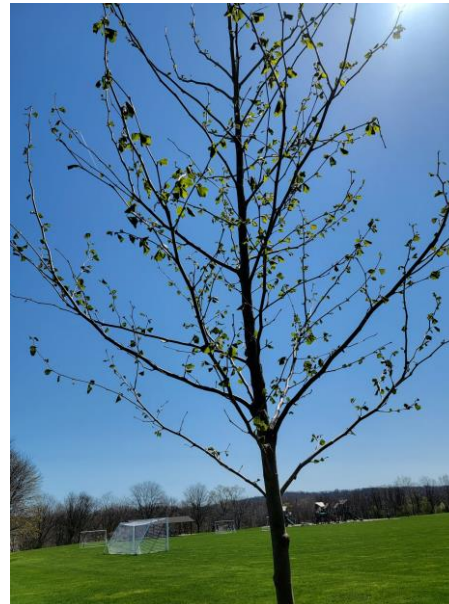
Newly planted Sycamore at Great Embankment Park.